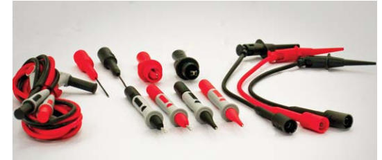
U1168A standard test lead kit