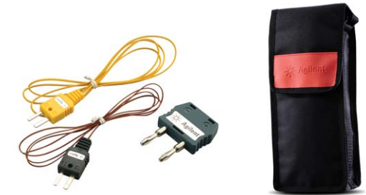
U1180A thermocouple adapter/lead kit